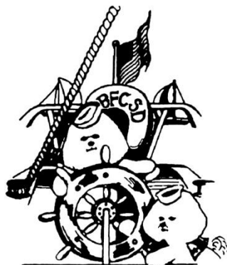
Bichon Frise Club of San Diego

Any exhibitor who does not adhere to these rules may be subject to disciplinary action.